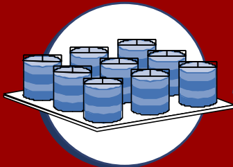
Store Financial Data In Normalized Analytical Grid Format For Comparisons