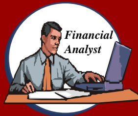
Build Company Financial Data From Source Documents (10-Q, etc)