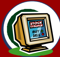
Add SEC, Stock Exchange, News, and Investor Relations Links