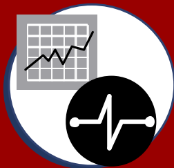
Monitor Company Earnings Releases. Proactively Update Database. Post New Reports To Client Websites.