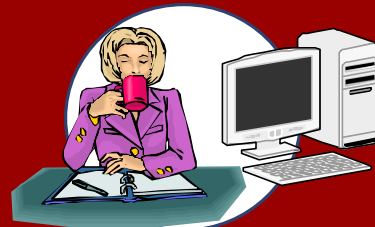
Authorized Clients Access Password-Controlled Website & Receive Email Bulletins

* Note: Peer companies may include publicly-listed foreign or domestic corporations and/or proprietary divisional data provided by client company under strict privacy control.