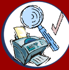
Validate Corporate Financial Data